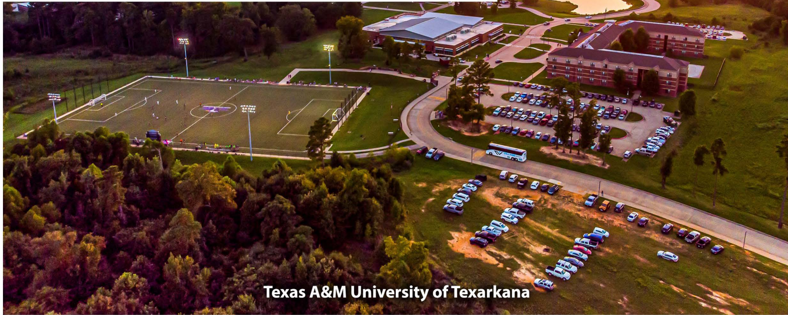
Texas A&M University of Texarkana

a community enriched by world class education