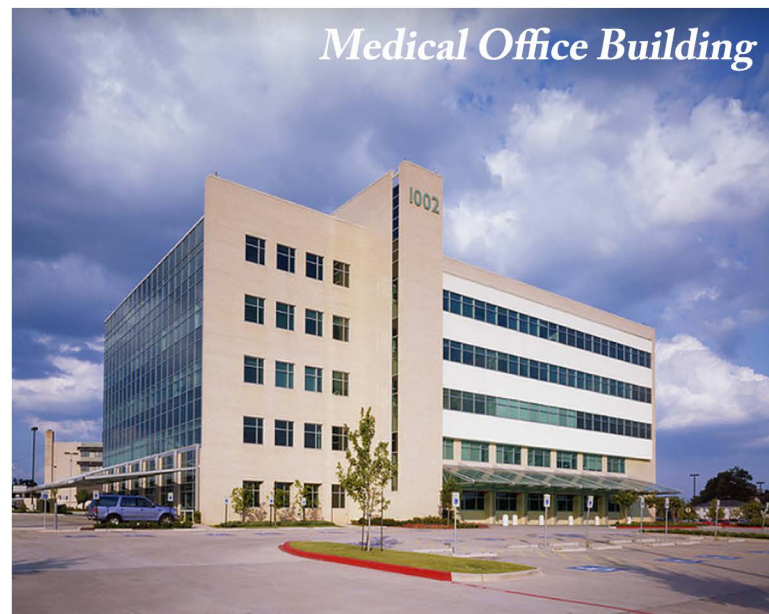
Medical Office Building