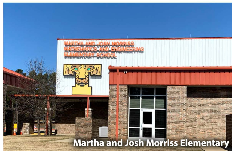
Martha and Josh Morriss Elementary