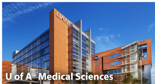
U of A Medical Sciences