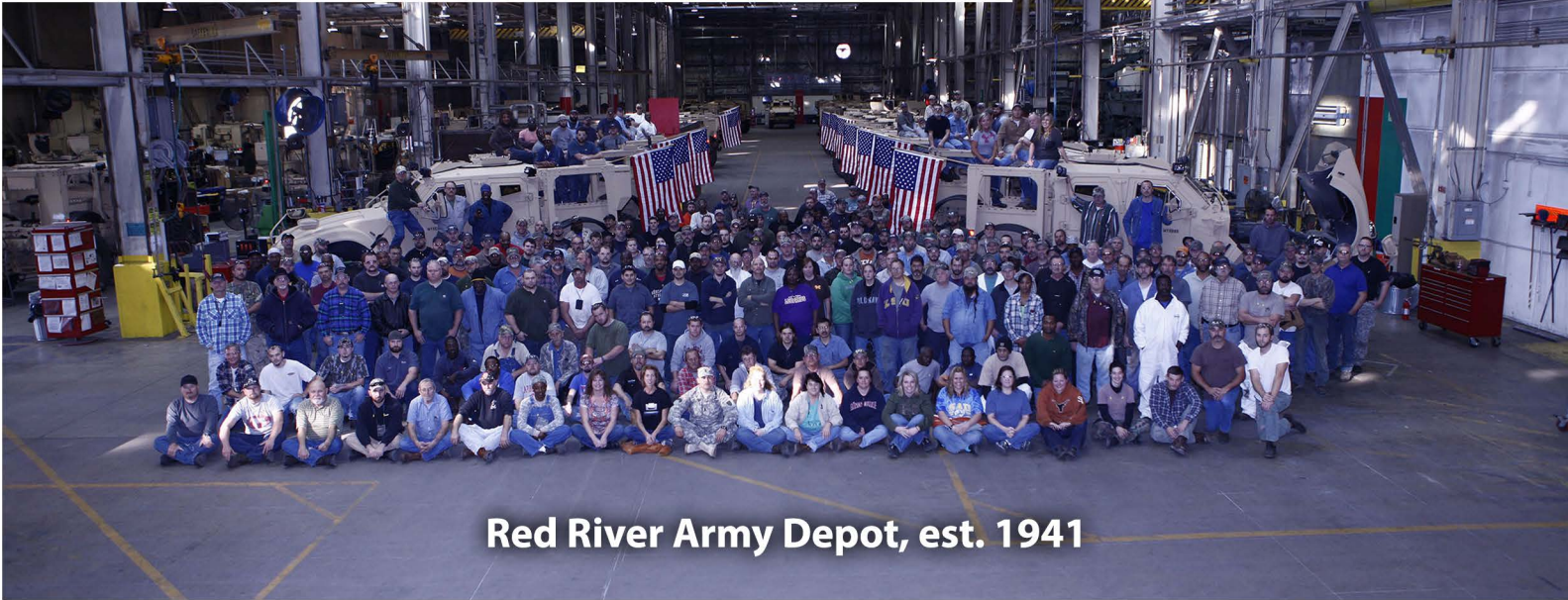
Red River Army Depot, est. 1941

a region strengthened by a diversified industry base