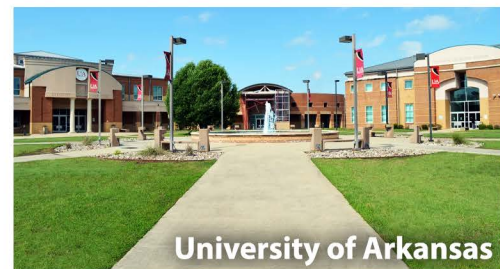
University of Arkansas