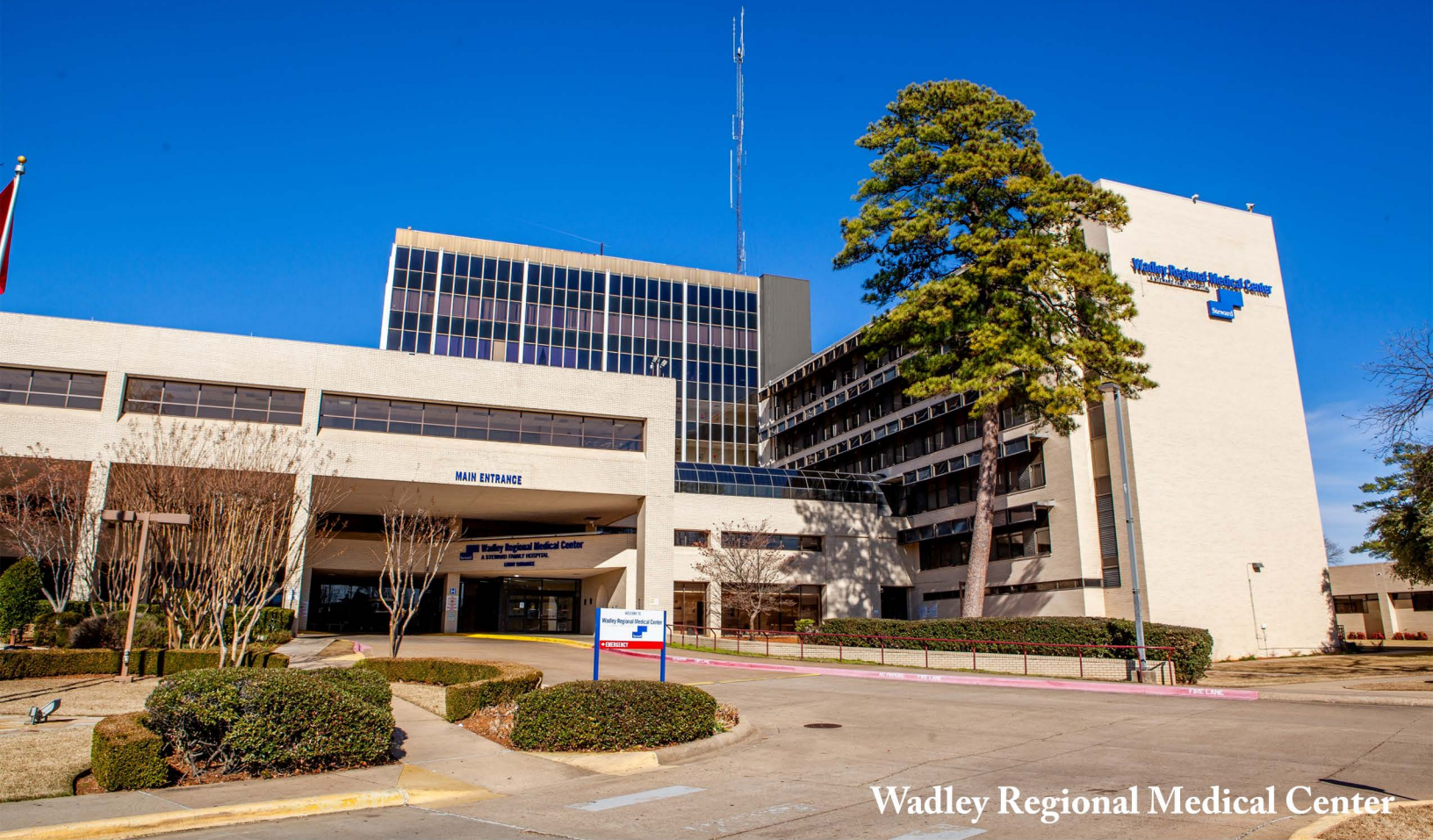
Wadley Regional Medical Center