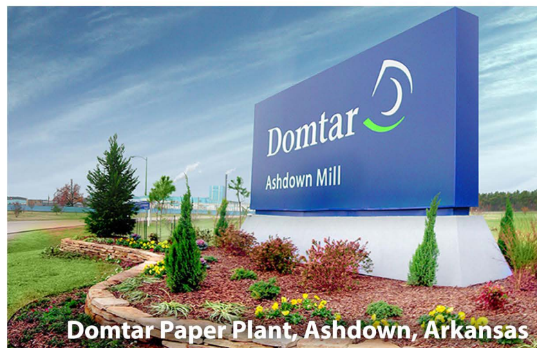
Domtar Paper Plant, Ashdown, Arkansas