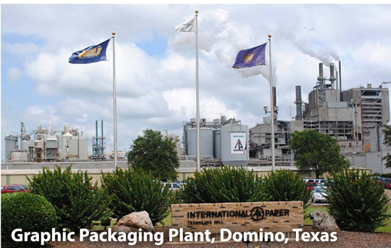
Graphic Packaging Plant, Domino, Texas